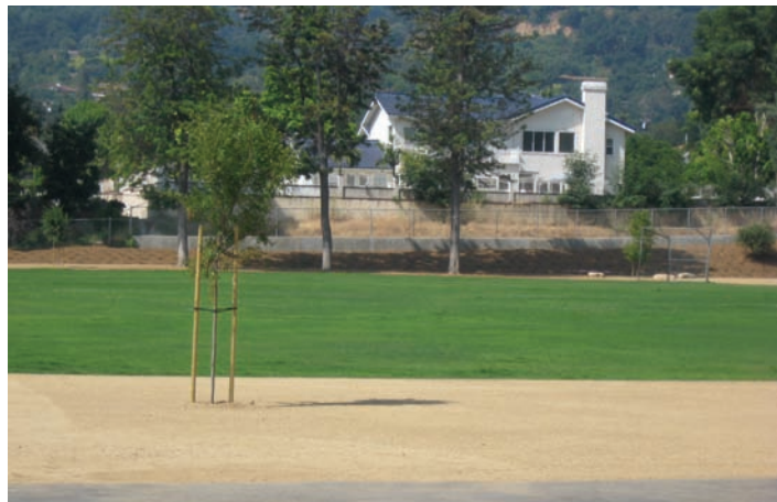
End uses of SoilPro Premium Compost include turf establishment, as illustrated in these before and after photos of an athletic field project.

diligent in ensuring that the IERCF's development and operation is economically, socially and ecologically sustainable. The fact that these materials are generated, processed and sold locally, reduce water consumption and protect ground and surface water resources, and represent a fair value to rate payers compared to other less economically and environmentally friendly options, such as disposal or long distance transport, combine to make the IERCA a great success. ■