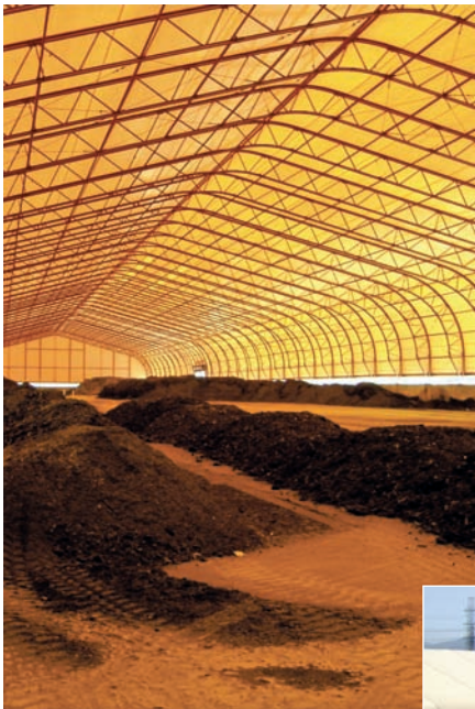
A fabric-covered building can hold nearly three months' production of compost (about 50,000 cubic yards). Storage space is often required during winter months, when sales are slower.

The IERCF's location, design and rigorous operational and environmental controls have helped the partnership achieve its goal... to build and operate a biosolids composting facility that exists in harmony with its surrounding environment and produces a marketable, high quality end product from recycled materials. The IERCA Board of Directors has been