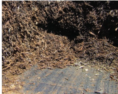
The biofilter contains over 50,000 cubic yards of chipped wood piled onto a perforated floor (inset). Designed air flow rate is 813,200 cubic feet/minute.

Support columns were strengthened and coated, but didn't have to be moved because their existing spacing allowed adequate room for operation of the John Deere 644 and 744 loaders used at the facility. The columns have a protective concrete wrap in case they get struck by a loader. After one incident of a column being hit, staff fitted loaders with a Doppler radar system that warns the operators with both audio and visual signals when they are near any structures.