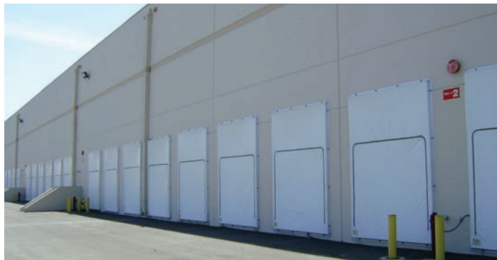
Trucks delivering biosolids and amendments drive into the building's receiving area through high-speed roll up doors that close immediately after they enter.

All air from inside the facility is also pulled by blowers through the biofilter. The negative flow of exhaust air is conveyed using a series of fans controlled by a SCADA (supervisory control and data acquisition) system. The SCADA system tracks all composting activity and records time and temperature conditions providing documentation required for meeting state and federal composting regulations. It also allows staff to operate facility equipment remotely, from front-end loaders or the floor. The entire facility is mapped out with wireless receivers that allow unrestricted access to SCADA controls within the facility. Recycled water is plumbed throughout the facility for use as