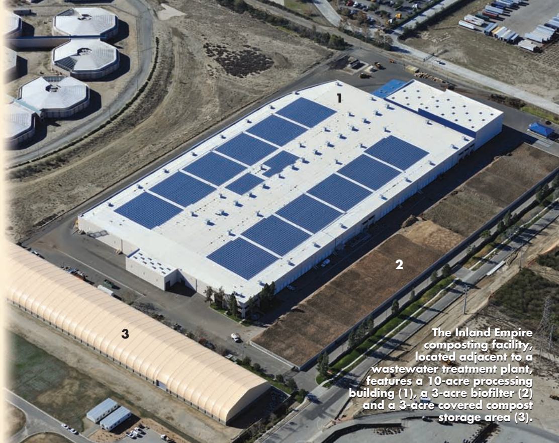
The Inland Empire composting facility, located adjacent to a wastewater treatment plant, features a 10-acre processing building (1), a 3-acre biofilter (2) and a 3-acre covered compost storage area (3).