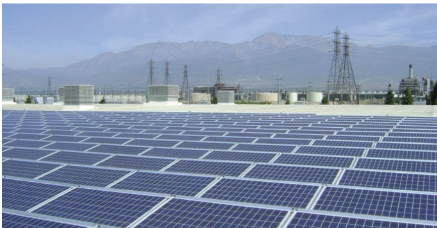
Over 6,000 solar panels on the roof of the IERCF can produce up to 1 MW of electricity, enough to furnish up to 50 percent of the power required to operate the facility.

By far the most onerous of the permitting required for the IERCF is the air permits. IERCF has two permits with the South Coast Air Quality Management District (SCAQMD). One regulates the overall facility, limiting annual feedstock throughput rates of all materials brought in to a maximum of 209,625 wet tons/year and 17,715 wet tons/month. It also stipulates that the design exhaust air capacity for the entire enclosed facility (maximum 813,200 cfm) is to be treated utilizing a biofilter. The second permit regulates the biofilter, setting design and operational constraints as well as performance standards. It establishes a minimum VOC and ammonia control efficiency of 80 percent (or greater) and specifies how and when compliance testing is to be conducted.