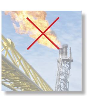
NO BIOGAS FLAME